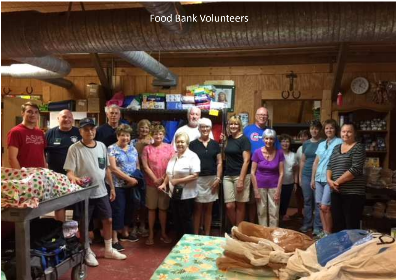
Food Bank Volunteers